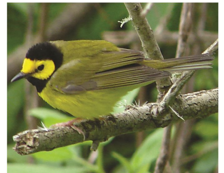
Hooded Warbler

Turn right on Eckert Drive into Lafitte's Cove, and park in the Nature Center parking lot. Check the ponds on the other side of the road for Roseate Spoonbill, Black-bellied Whistling Duck, Wilson's Snipe, and shorebirds. In winter, Bufflehead and Redhead may be seen. Cross back to boardwalk, quietly checking for Sora and the occasional Glossy Ibis in the pond on the right. In winter, Green-winged and Blue-winged Teal are common. Just past the boardwalk, the pond on the left is also good for waterfowl. Follow the trail to the right to check for Black-crowned Night-Heron and Green-winged Teal. During spring, the woods on the left are excellent for colorful migrants such as Baltimore Oriole, Indigo Bunting, Northern Parula, Hooded Warbler, tanagers, and up to 6 species of vireos. There are multiple water drips and a maze of trails, so plan to spend some time here.