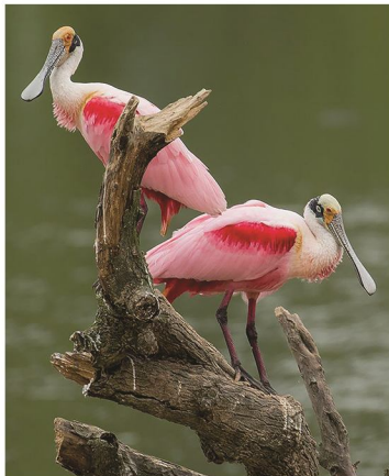
Roseate Spoonbills